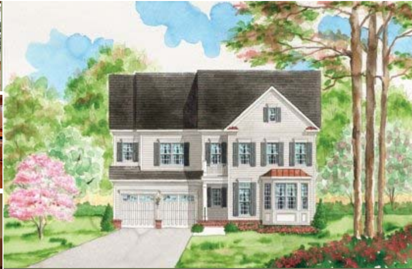
The Spencer at Brambleton

HOMESITE: #BK1758 AVAILABLE: July/August 2008 MODEL: Spencer PRICE: $698,064 REDUCED TO: $669,000