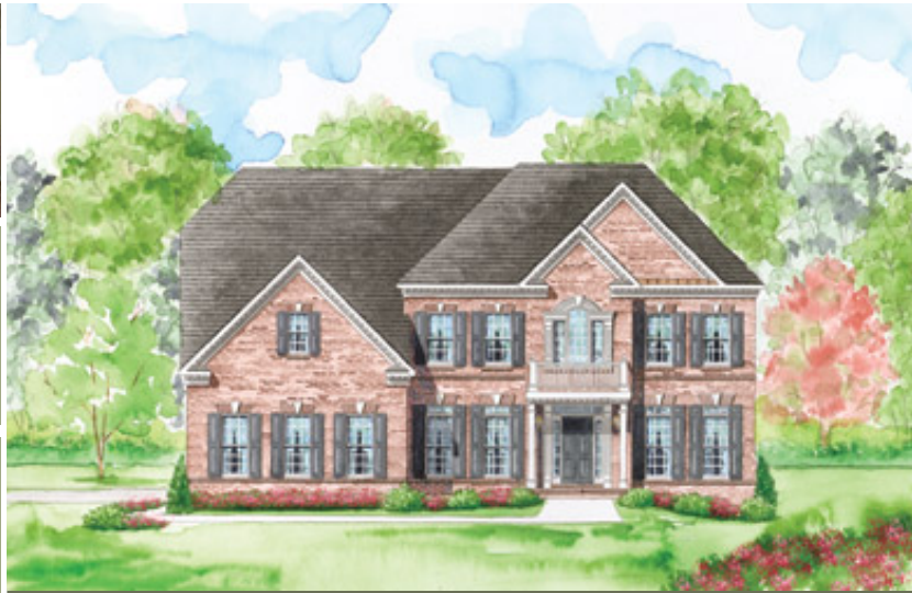
The Garrett at South Riding

HOMESITE: #RR0160 AVAILABLE: Aug/Sept 2008 MODEL: Garrett PRICE: $942,504 REDUCED TO: $825,780